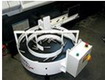
11 PM - Tuesday