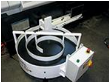
5 PM - Tuesday

The Royal Rota-Rack™ unlocks hours of extra unmanned production potential. Simply load your bar feeder before you leave for the night and be greeted the next morning by a Rota-Rack full of finished parts.