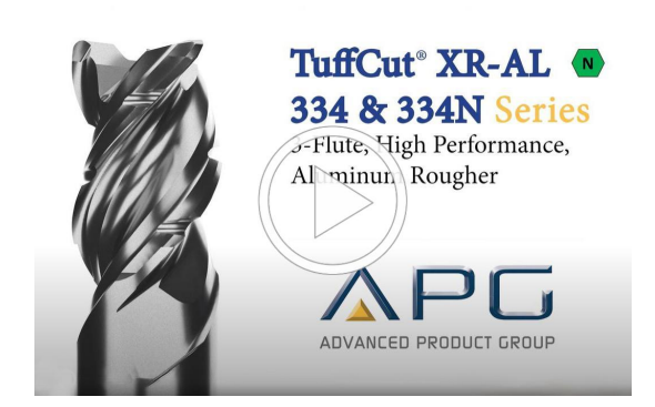
TuffCut® XR-AL Series 334

The TuffCut® XR-AL's, 334 Series Aluminum rougher is capable of roughing with both dynamic and traditional roughing toolpaths, including ramping capabilities up to 30°. Now offered both with our Gem Plus (DLC) coating and a more economical uncoated variant.