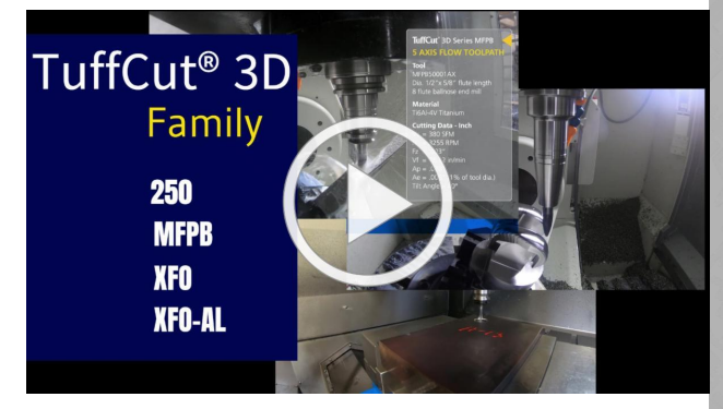
TuffCut® 3D Family

The TuffCut® XR-AL's, 334 Series Aluminum rougher is capable of roughing with both dynamic and traditional roughing toolpaths, including ramping capabilities up to 30°. Now offered both with our Gem Plus (DLC) coating and a more economical uncoated variant.