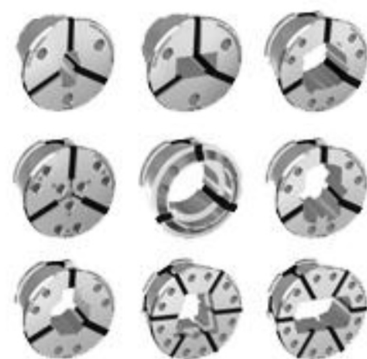
Custom-shaped collets are perfect for second-op work because they provide full surface contact for reduced risk of part distortion.

1-800-645-4174 • info@royalproducts.com • www.royalproducts.com