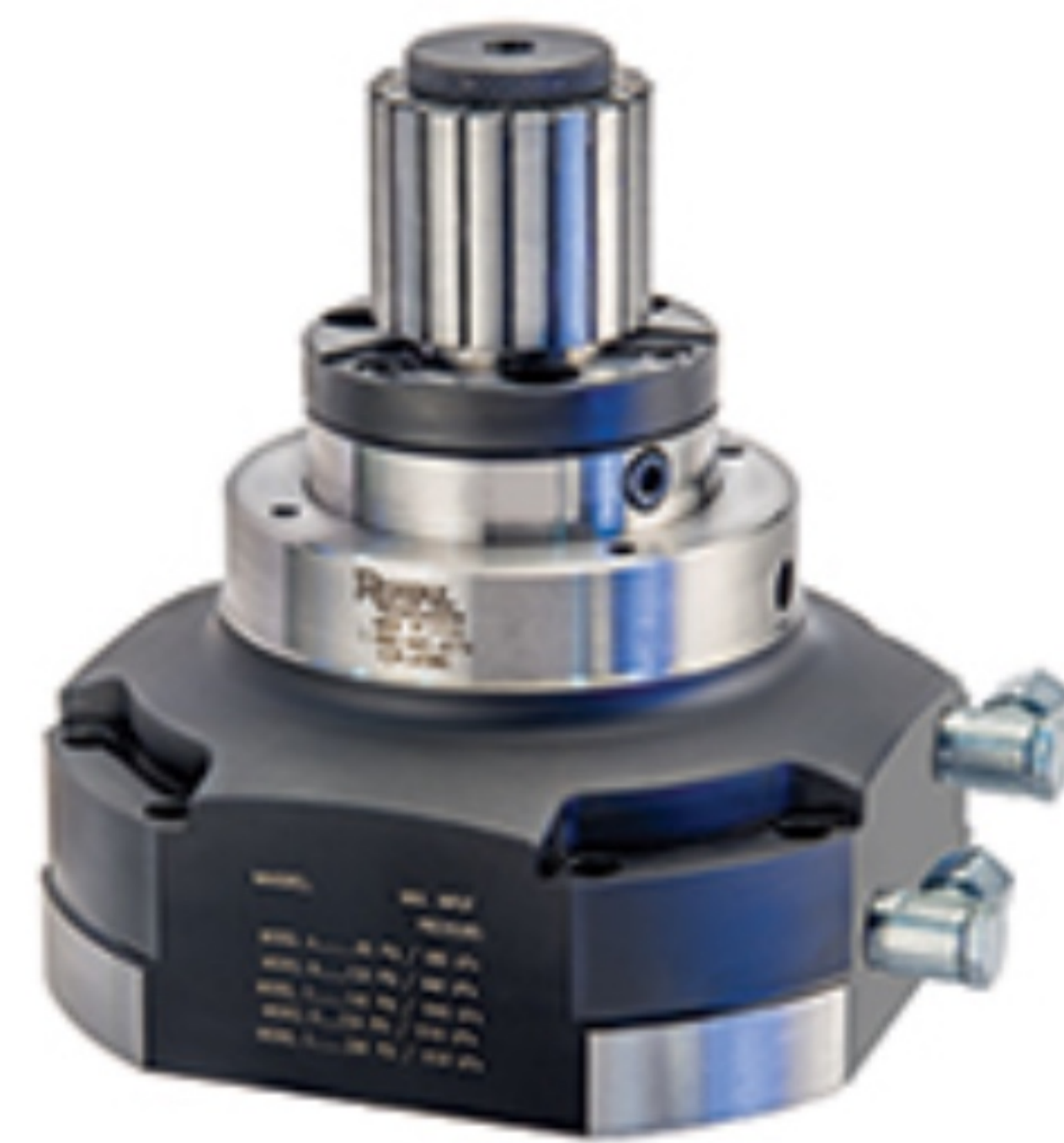
Internal Part Gripping Hydraulic/Pneumatic