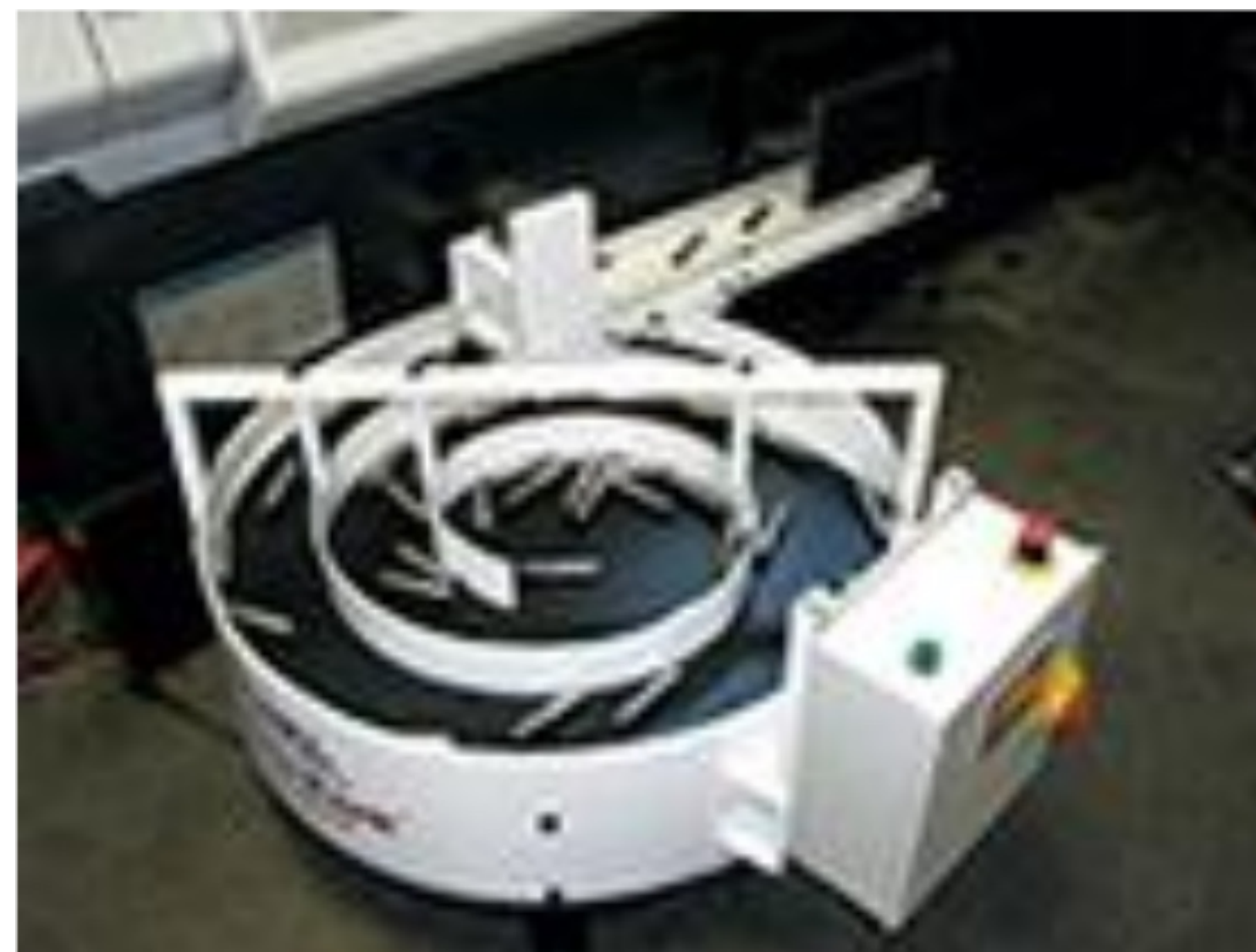
11 PM - Tuesday